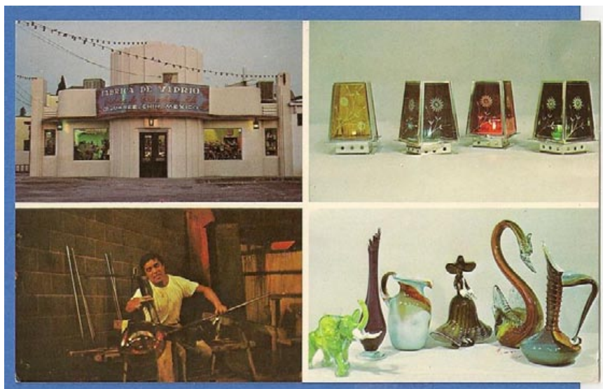
A Mexican glass factory and examples of Mexican glass